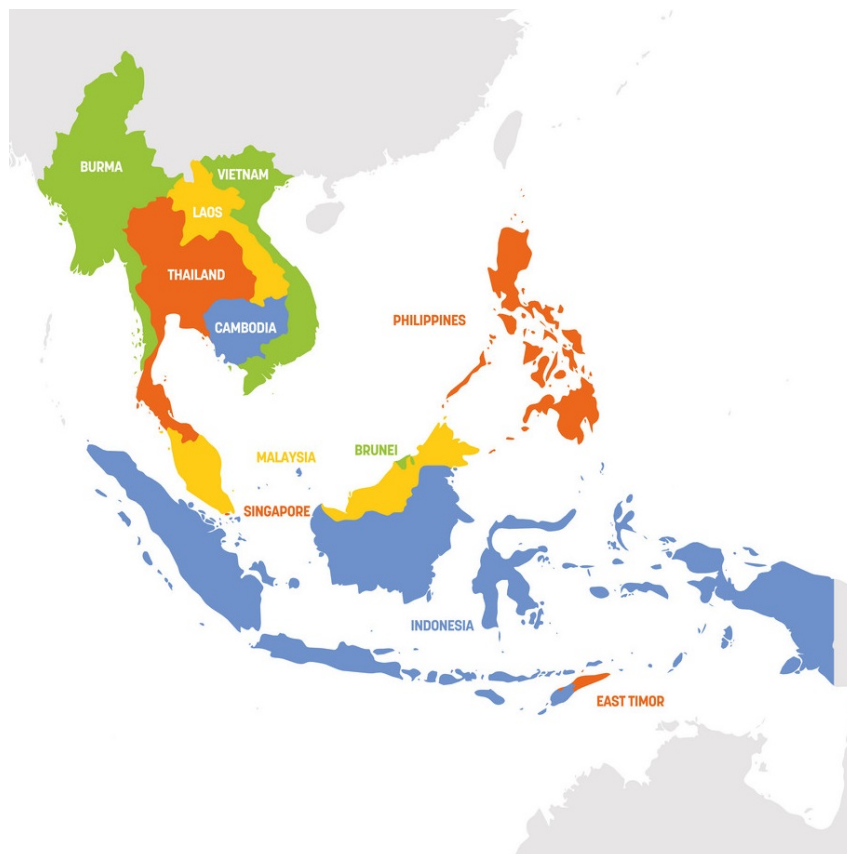
FIGURE 1.3: Southeast Asian geographical region map (Pytyczek, nd b)