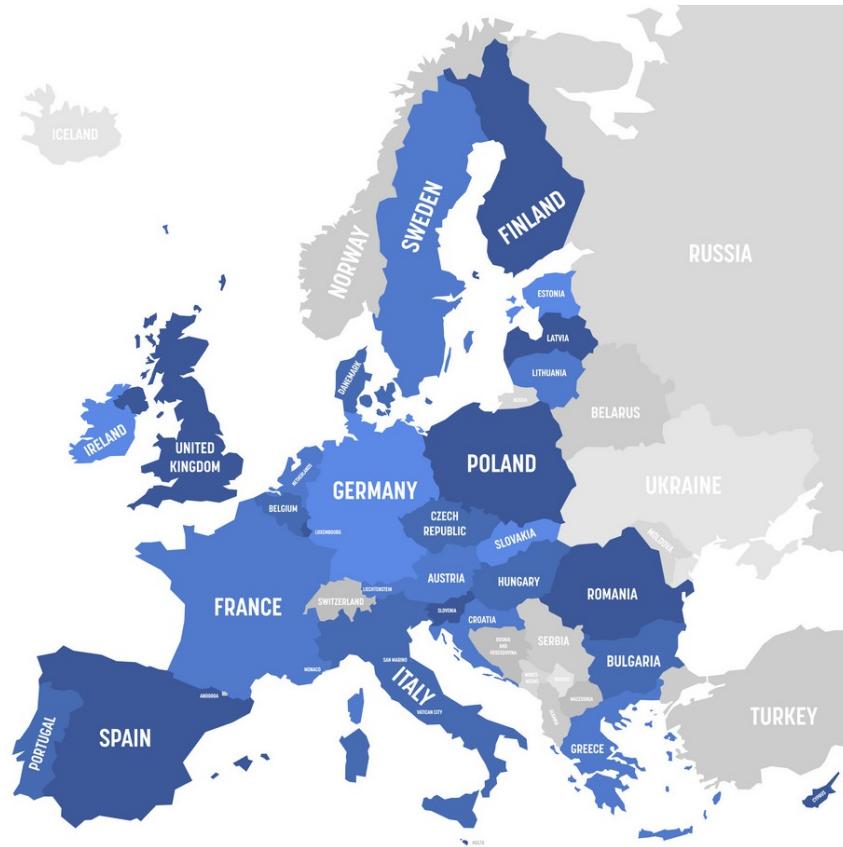
FIGURE 1.2: European Union map (Pytyczek, nd a)